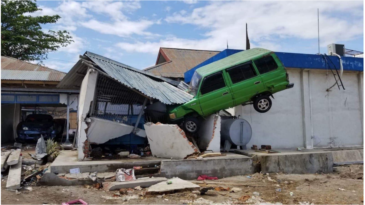
Aftermath of tsunami that struck Sulawesi, Indonesia (September 2018)