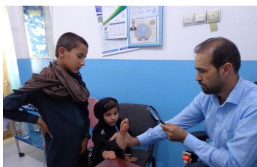
Japan Afghanistan Friendship Hospital