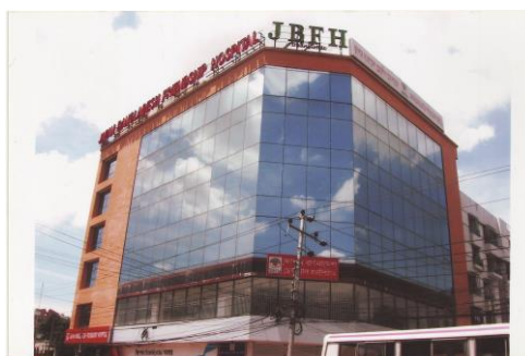
Japan Bangladesh Friendship Hospital