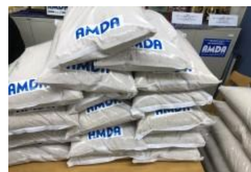
Bags of rice to be donated

Literally translated as “children’s cafeteria”, kodomo shokudo is a voluntary-run canteen that offers nutritional meals at a reasonable cost for economically-challenged children. While similar facilities have been set up around the nation to tackle poverty, AMDA has been donating funds and food items to a few canteens in the suburb of Okayama since December 2017.